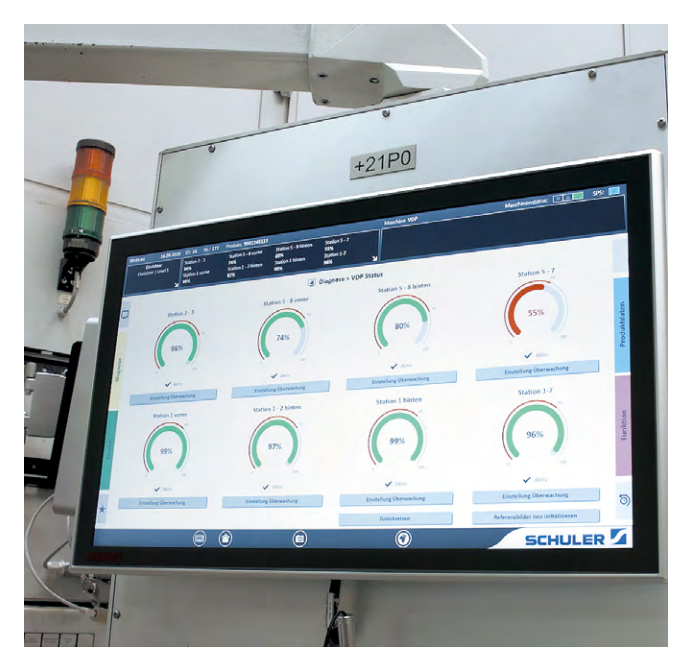
One monitoring function reports an error.