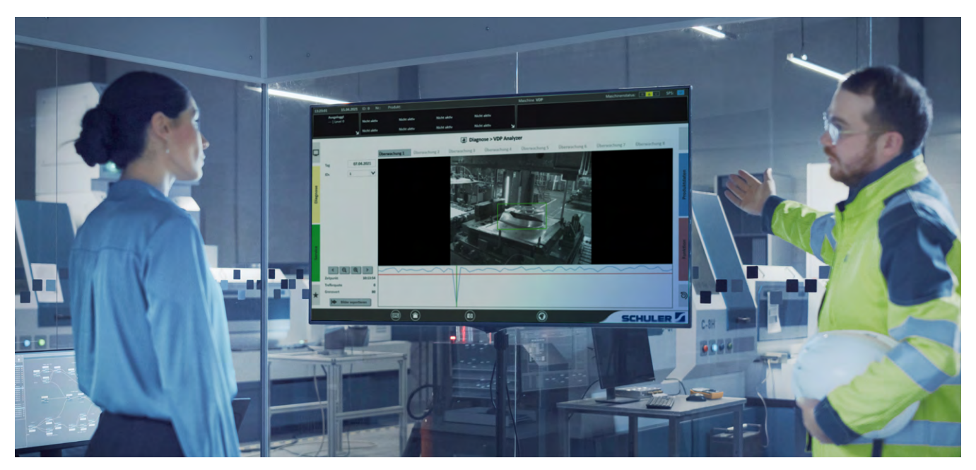
The Visual Die Protection Analyzer provides detailed insight into error history, even remotely.