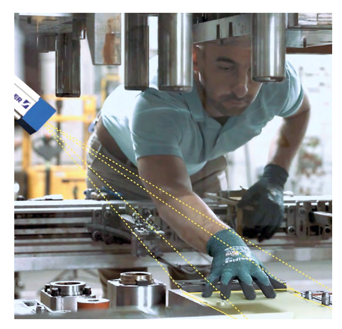
Visual Die Protection detects foreign objects or other sources of danger in real time and stops the line before any damage occurs.

Thanks to the simple retrofit and the wide range of applications of Visual Die Protection, users quickly benefit from our system. In addition to use on transfer presses, in press lines or for progressive dies, applications in plastics processing or on assembly lines are also possible. The connection of the system is manufacturer-independent and not limited to forming technology.